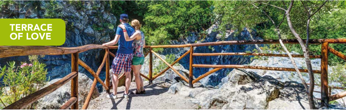
TERRACE OF LOVE